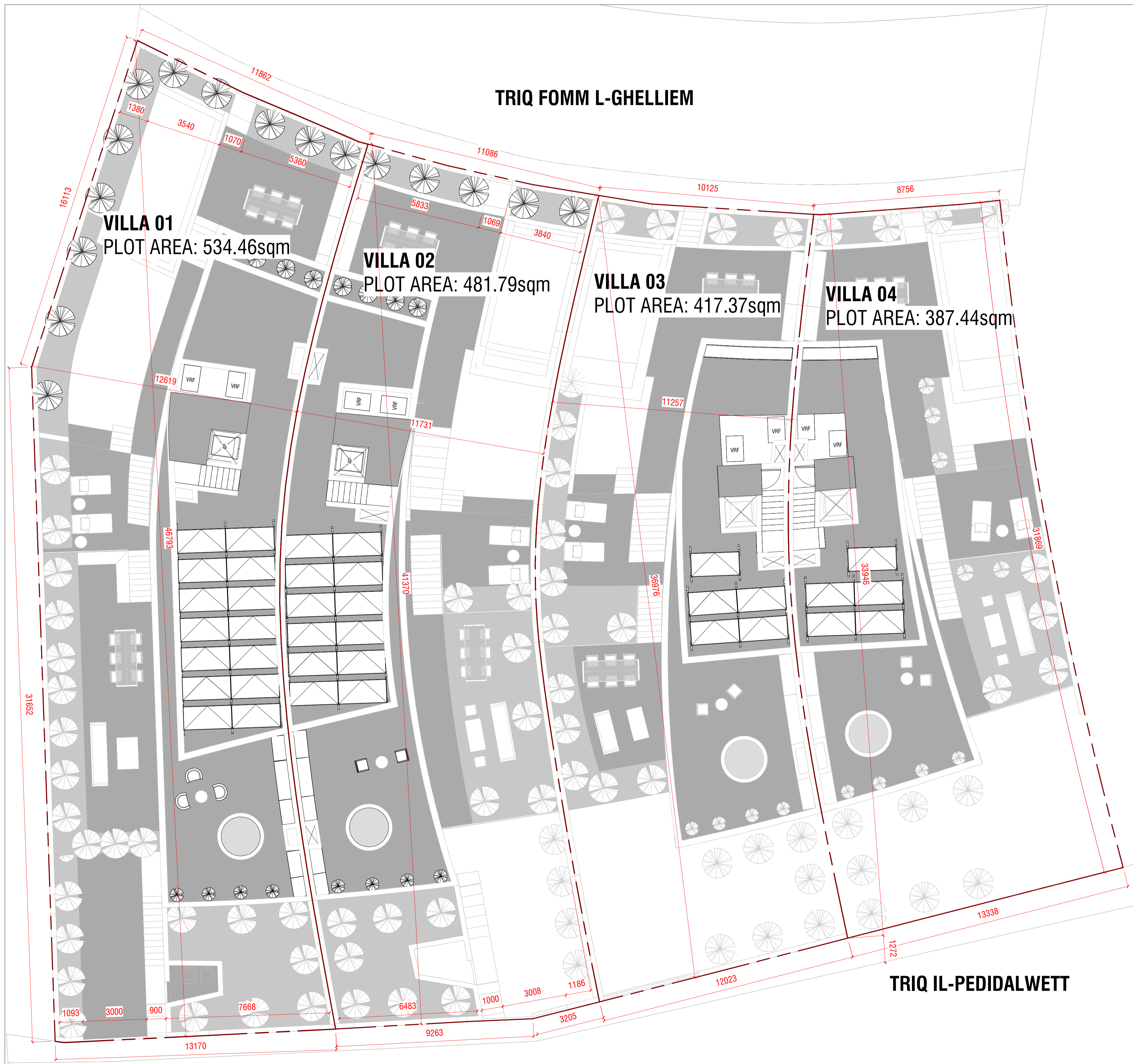
BLOCK PLAN SCALE 1:100

3DM ARCHITECTURE Triq il-Fumara, Zone 4 Central Business District Birkirkara, CBD4040, Malta