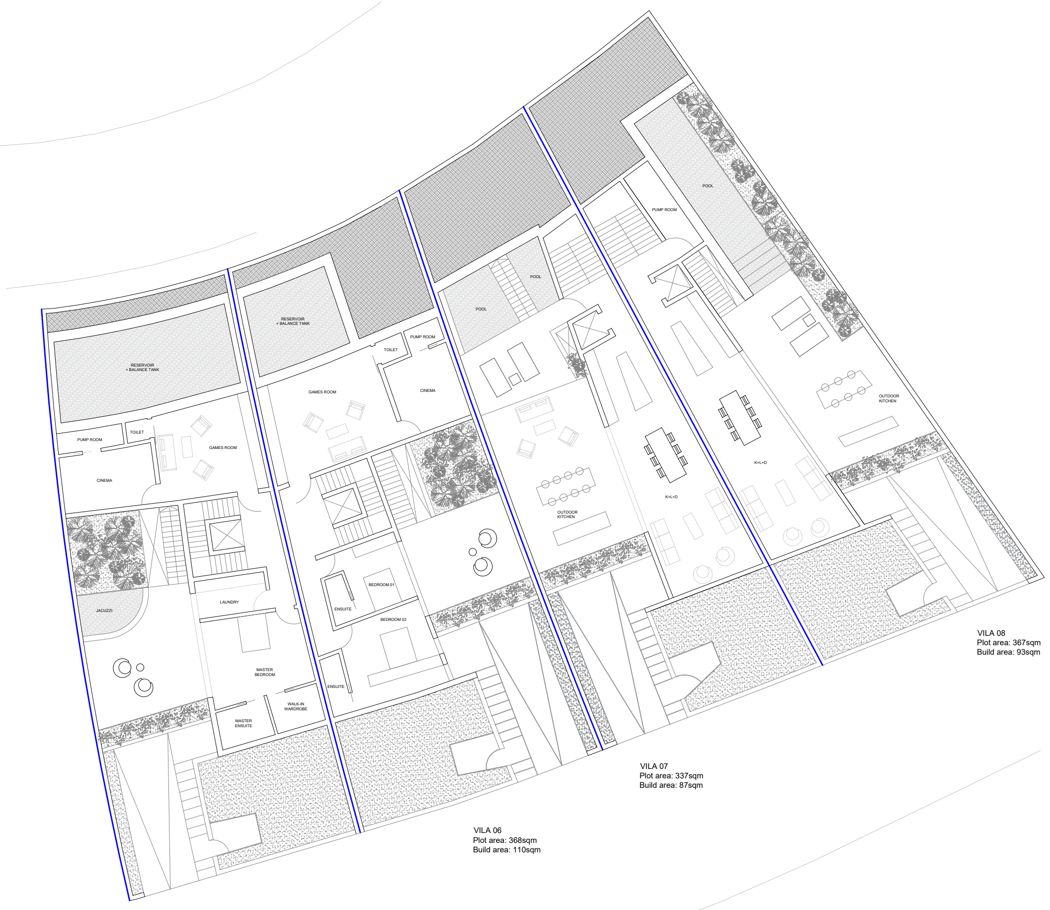
VILA 05 Plot area: 363sqm Build area: 103sqm