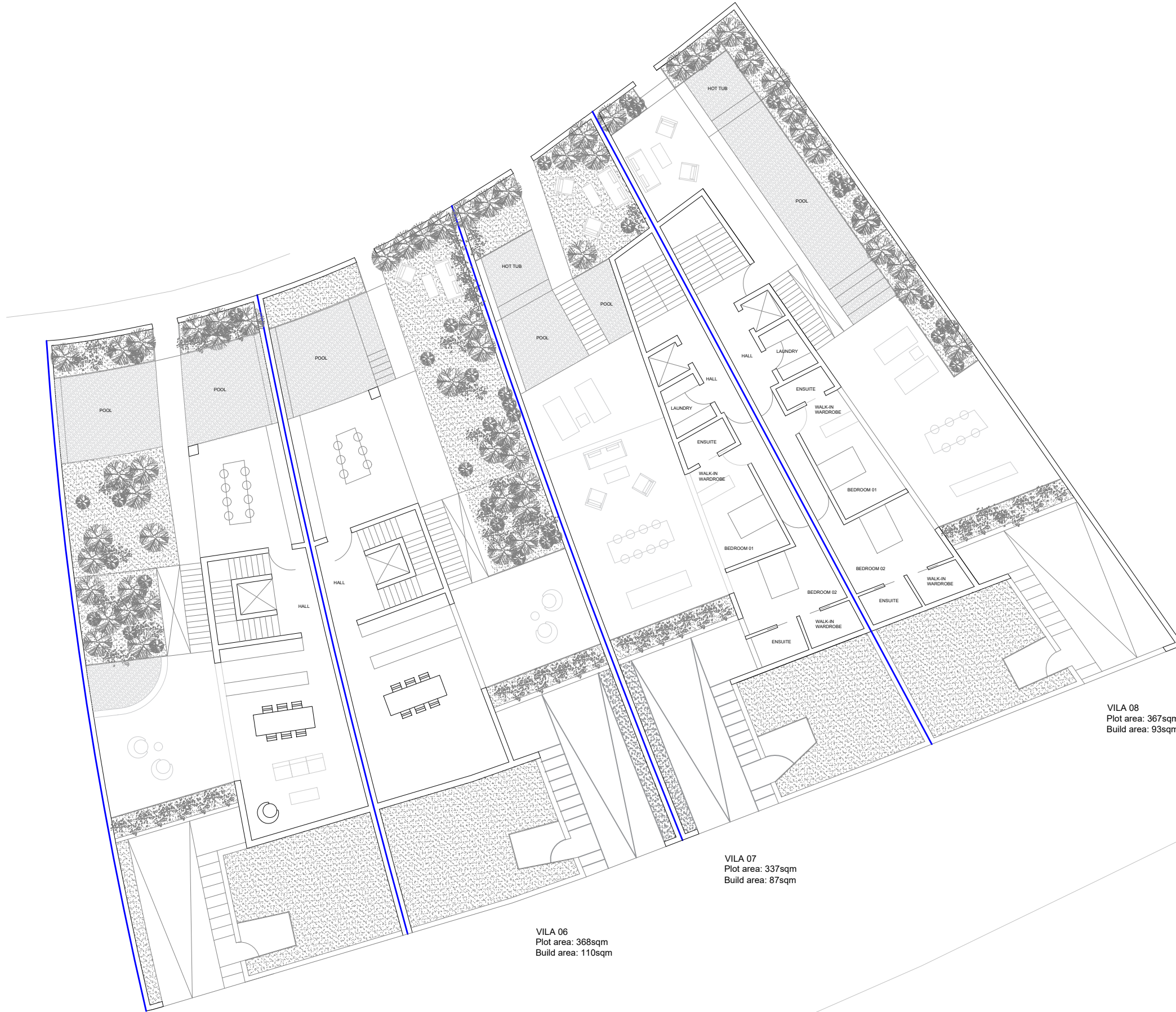
VILA 05 Plot area: 363sqm Build area: 103sqm