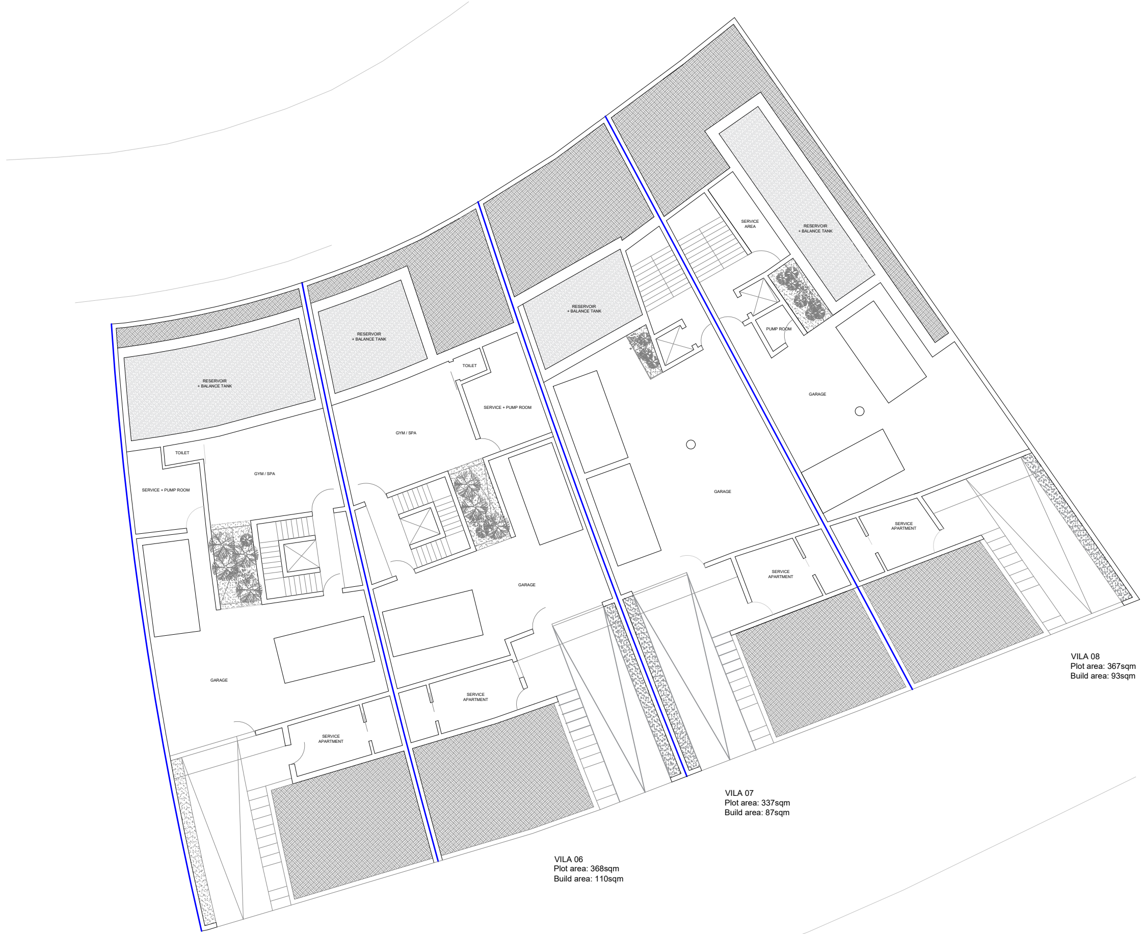
VILA 05 Plot area: 363sqm Build area: 103sqm